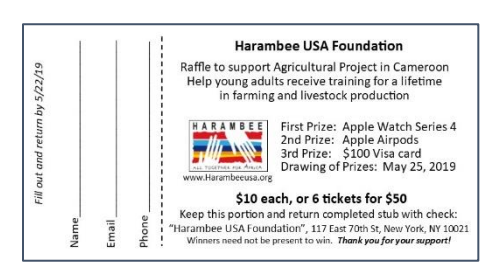
Raffle Ticket sales