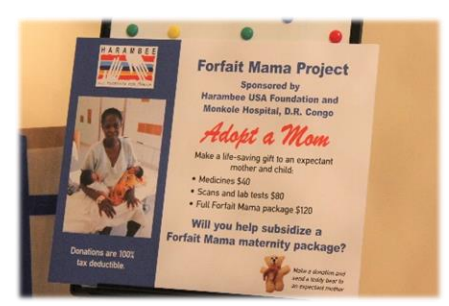
Forfait Mama fundraising event