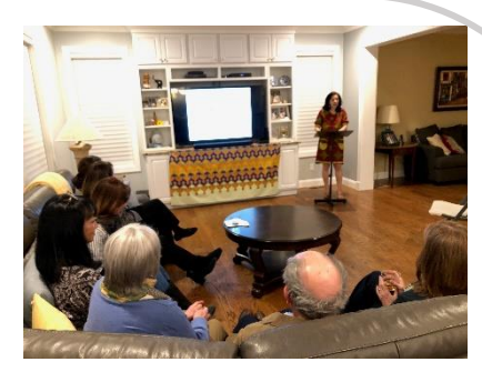
Dinner with Purpose